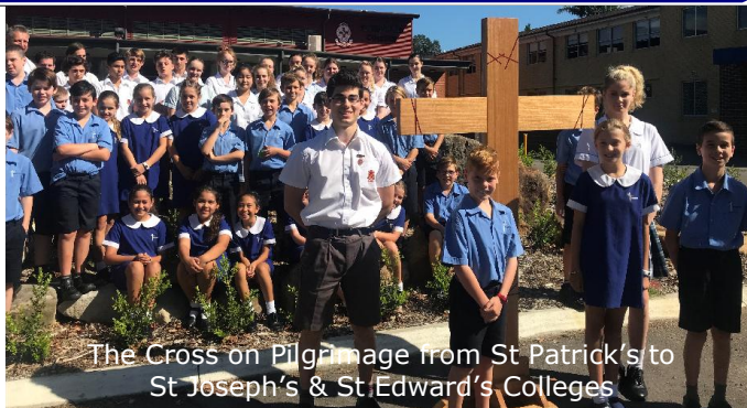
The Cross on Pilgrimage from St Patrick's to St Joseph's & St Edward's Colleges

"Come Holy Spirit of Youth. Fill the hearts of young people with the hope and love of Jesus Christ; enliven our community with the creativity, energy and joy of youth; guide us together, as we strive to offer God's mercy to those who feel abandoned or outcast."